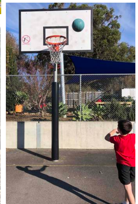
Testing out the new basketball ring!