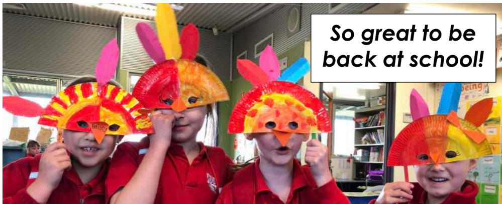
So great to be back at school!