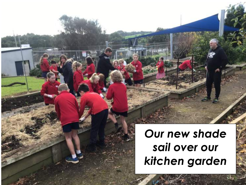
Our new shade sail over our kitchen garden