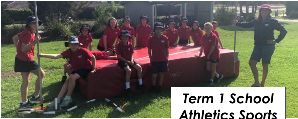
Term 1 School Athletics Sports Another fun and successful year!