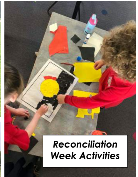
Reconciliation Week Activities